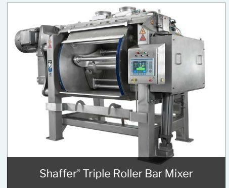
Shaffer ® Triple Roller Bar Mixer

Shaffer ® Triple Roller Bar Mixers are ideal for breads, rolls, buns, bagels, English muffins, flour tortillas, pizza crusts, sweet goods, and frozen doughs. The mixer is available in open or enclosed frame designs and is engineered to meet your bakery's specific needs.