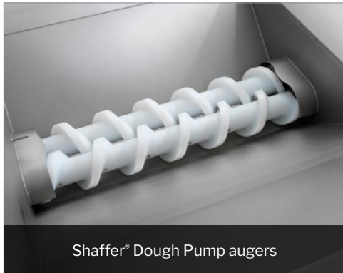
Shaffer® Dough Pump augers

*STONEKOTE® is a registered trademark of E. L. Stone Company.