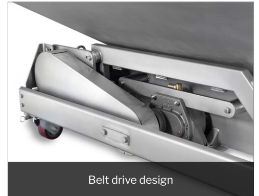
Belt drive design

For additional information or to request a quote, call +1.937.652.2151 or email info@shaffermixers.com .