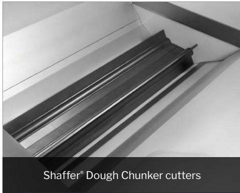
Shaffer® Dough Chunker cutters