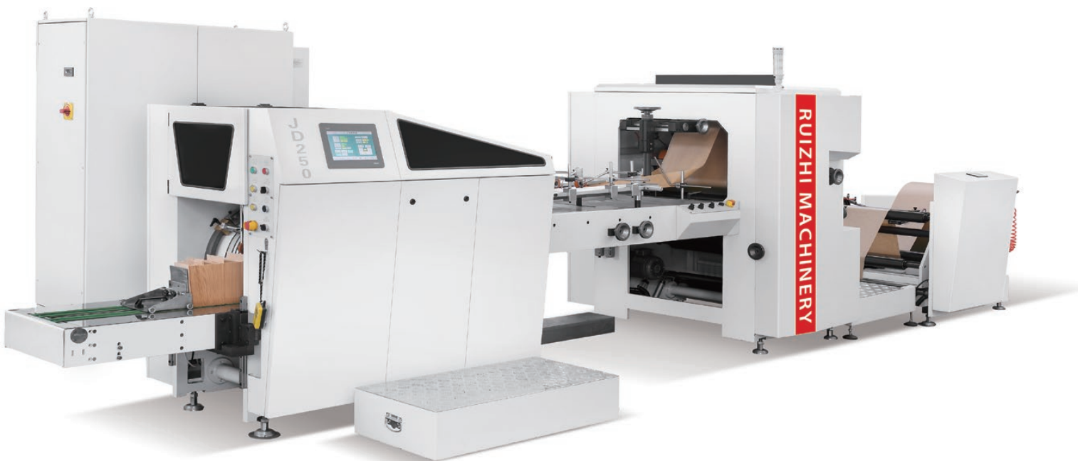
Machine for Production of Paper Bags with Window

able increase in productivity among our customers. Robatech is, therefore, our exclusive supplier, when it comes to window gluing," highlights YiZhi Xu. "As we export 70% of our machines, our customers also benefit from Robatech's global service network. All of this results in added value for us as a machine builder as well." In the end, everybody benefits from a flawlessly glued window.